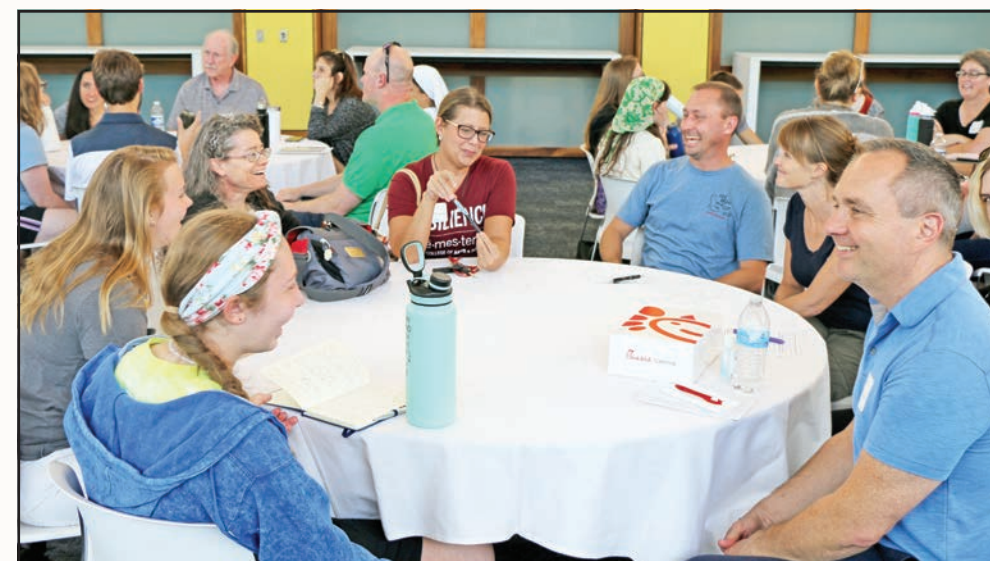
Participants in the archdiocese's Office of Youth Ministry's third annual Into the Heart Conference have a group discussion during the Aug. 13 event at Marian University in Indianapolis.

(For more information on the archdiocesan Office of Youth Ministry, visit www.archindyym.com .) †