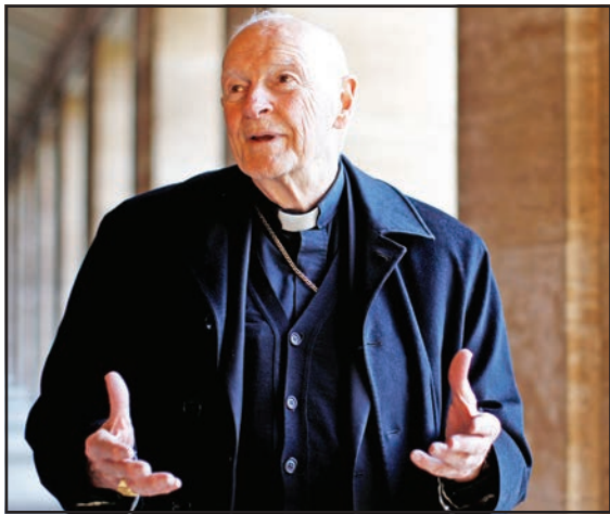
Pope Francis has accepted the resignation from the College of Cardinals of Cardinal Theodore E. McCarrick, retired archbishop of Washington, and has ordered him to maintain "a life of prayer and penance" until a canonical trial examines accusations that he sexually abused minors. Archbishop McCarrick is pictured in a 2013 photo at the Vatican.