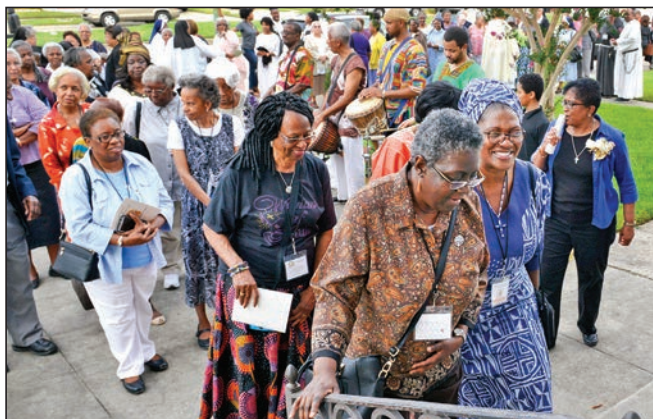
Women religious from the National Black Sisters Conference process into St. Raymond-St. Leo the Great Church in New Orleans on July 30. They gathered with members of the National Black Catholic Clergy Caucus, the National Black Catholic Seminarians Association and the National Association of Black Catholic Deacons for the opening Mass of the Joint Conference 2018.

The conference celebrated the 50th anniversary of the National Black Catholic Clergy Caucus and the National Black Sisters Conference and their formation of strong black Catholic men and women of service. †