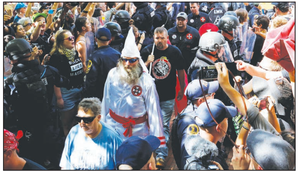
Riot police protect members of the Ku Klux Klan from counter-protesters as they arrive in Charlottesville, Va., in 2017 to rally against city proposals to remove or make changes to Confederate monuments in Charlottesville. The rally by far-right demonstrators led to the death of a counter-protester.

"Do not confine your prayer to one day. Commit to praying, listening, learning, thinking and working for peace, justice and an end to racism," he wrote. "Our faith calls us to be witnesses of the Gospel. Be that witness in working to eliminate racism within our culture." †