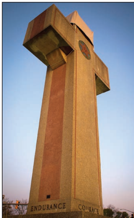
A cross-shaped monument, a landmark in Bladensburg, Md., is pictured in this 2017 photo. It was constructed in 1925 as a memorial to 49 men from Prince George's County, Md., lost in World War I. The Thomas More Law Center, a national public interest law firm based in Ann Arbor, Mich., filed a brief on July 27 in the U.S. Supreme Court in what it called "a last-ditch effort" to save the 40-foot cross.

Known as the Bladensburg Cross or the Peace Cross, the cement and marble memorial was erected by the Snyder-Farmer Post of the American Legion of Hyattsville, Maryland, to recall the 49 men of Prince George's County who died in World War I. The cross, whose construction was funded by local families, was dedicated on July 13, 1925.