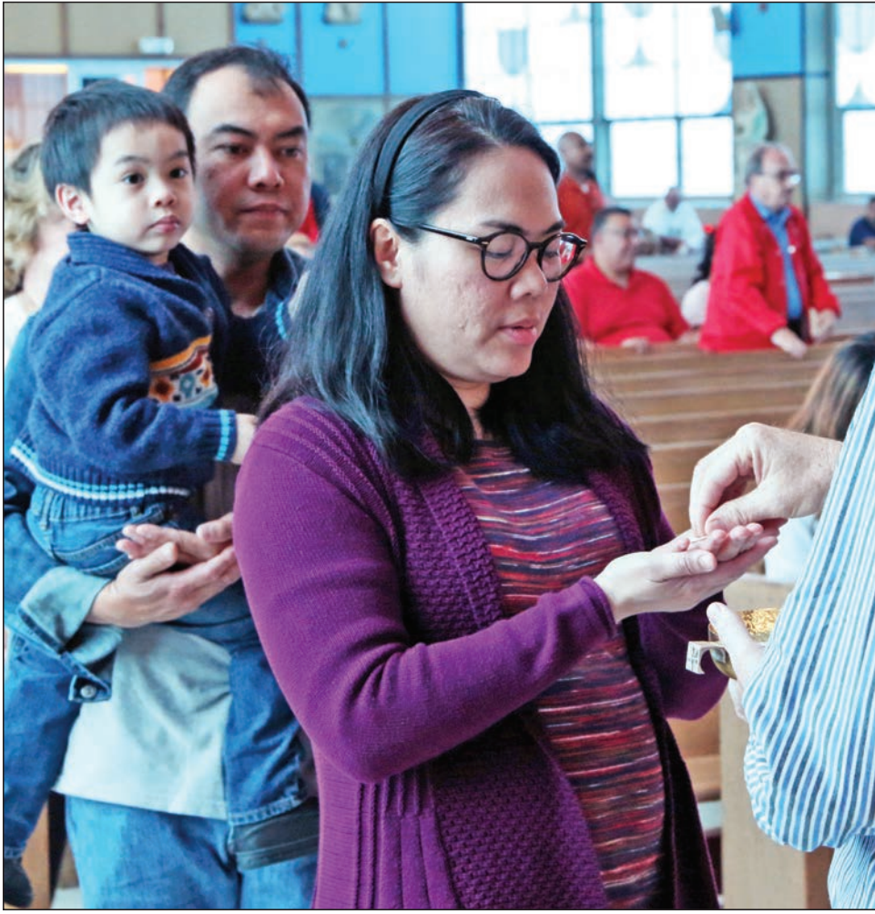
A woman receives Communion during Mass on June 3 at Our Lady of Mount Carmel Church in Patchogue, N.Y.