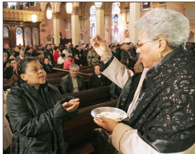
An extraordinary minister of holy Communion distributes Communion during Mass at Transfiguration Church in the Williamsburg section of Brooklyn, N.Y. A new survey by the Center for Applied Research in the Apostolate in Washington shows 78 percent of men and women religious superiors favor ordaining women to the diaconate.

This particular study, it said, “sought to understand how superiors or religious institutes in the United States think about the question of female deacons during a time in which a papal commission is studying this issue. It should provide insight into how these respondents might react to the work of that commission in the future.” †