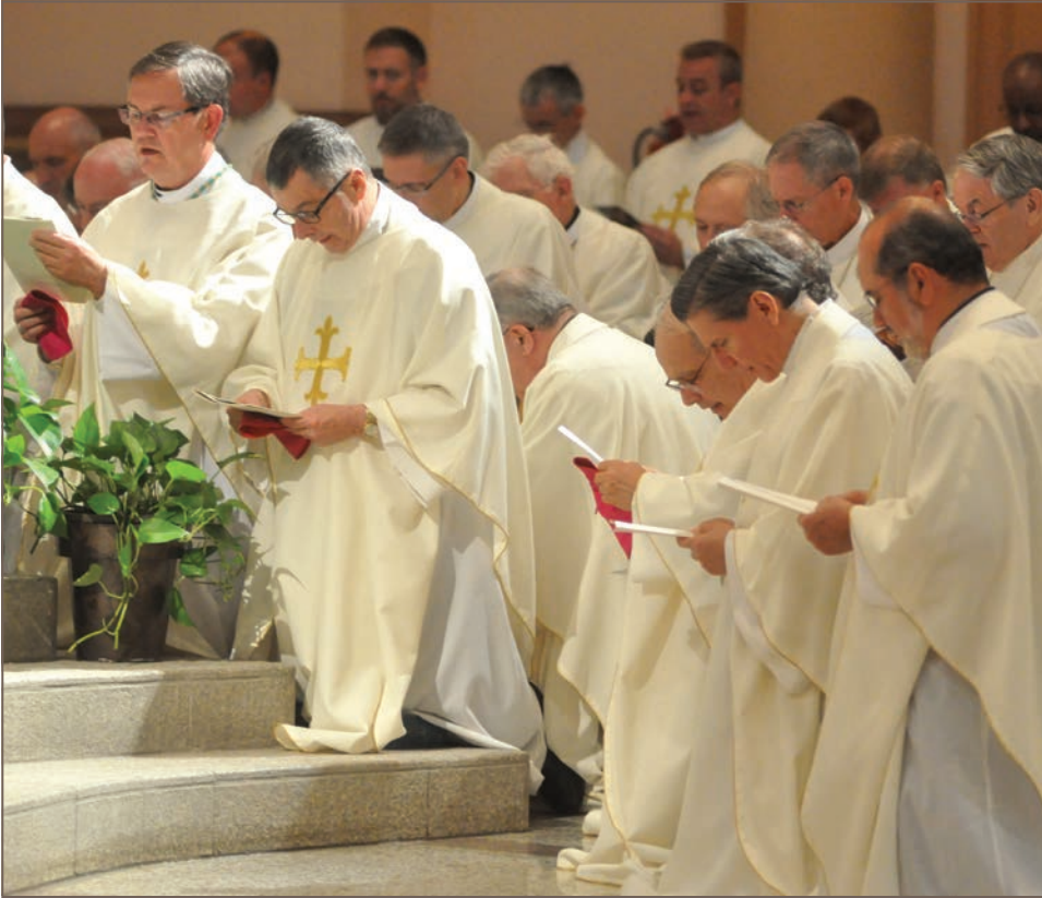
Bishops kneel while praying for victims of clergy sexual abuse during Mass on June 14, 2017, at SS. Peter and Paul Cathedral in Indianapolis during the U.S. Conference of Catholic Bishops' annual spring assembly.