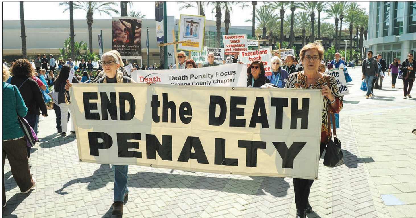
Demonstrators protest the death penalty in Anaheim, Calif., on Feb. 25, 2017. Pope Francis has ordered a revision to the catechism to state that the death penalty is inadmissible, and he committed the Church to its abolition.

Cardinal Ladaria also noted that the popes were not the only Catholics to become increasingly aware of how