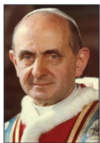
Blessed Paul VI

At a meeting on March 6 with Cardinal Angelo Amato, prefect of the Congregation for Saints' Causes, Pope Francis signed decrees for the