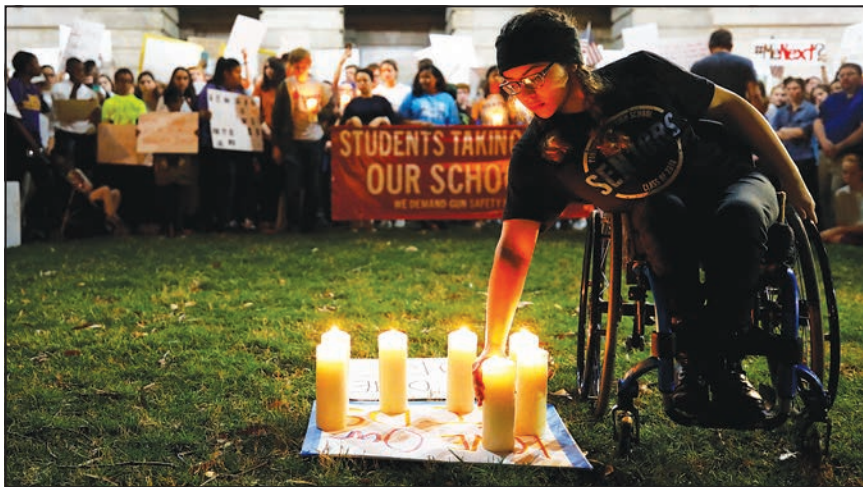
A student lights a candle in front of the North Carolina Capitol in Raleigh on Feb. 20 in memory of the victims of the shooting at Marjory Stoneman Douglas High School in Parkland, Fla.