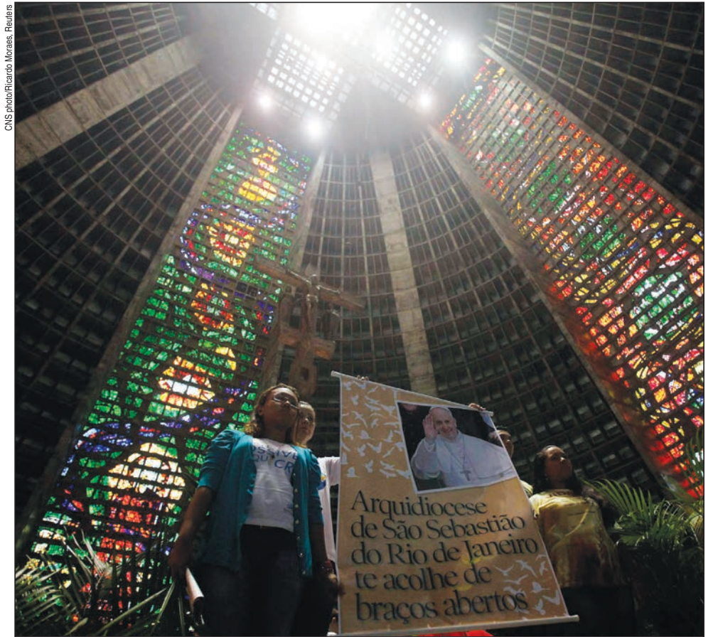
Youths hold up a banner with a message of welcome for Pope Francis during Palm Sunday Mass in Rio de Janeiro’s cathedral on March 24. The new pope will travel to Rio in July to take part in the international World Youth Day gathering.