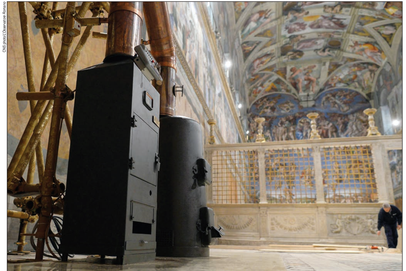
Stoves used to burn ballots during a papal conclave are seen in the Vatican's Sistine Chapel on March 8. The election of the pope is a free election with secret ballots.

We write the full name on a blank paper, fold it so that