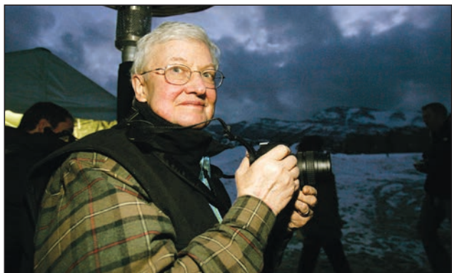
Film critic Roger Ebert is seen during the 2006 premiere of “The Night Listener” at the Sundance Film Festival in Park City, Utah. The Pulitzer Prize-winning critic, who was raised Catholic, died on April 4 at age 70 in Chicago. Ebert had been dealing with a series of health struggles since being diagnosed with papillary thyroid cancer in 2002.

When he knew he was dying, Ebert wrote about his