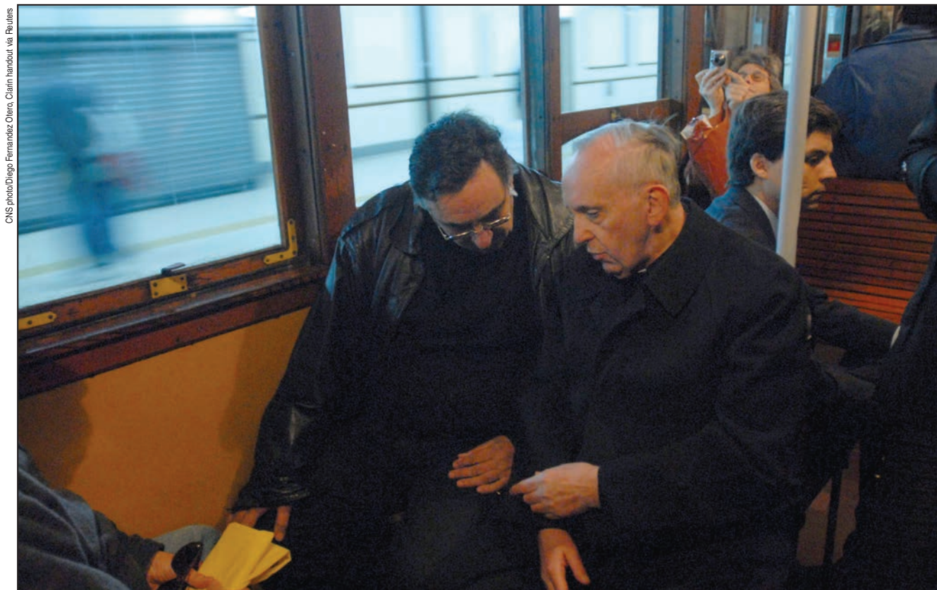
Argentine Cardinal Jorge Mario Bergoglio, right, now Pope Francis, is pictured traveling by subway in Buenos Aires, Argentina, in 2008. In a book published in 2010, then-Cardinal Bergoglio said he enjoyed travelling by subway or bus.

• Favorite painting: "The White Crucifixion" by Marc Chagall. The scene "isn't cruel, rather it's full of hope."