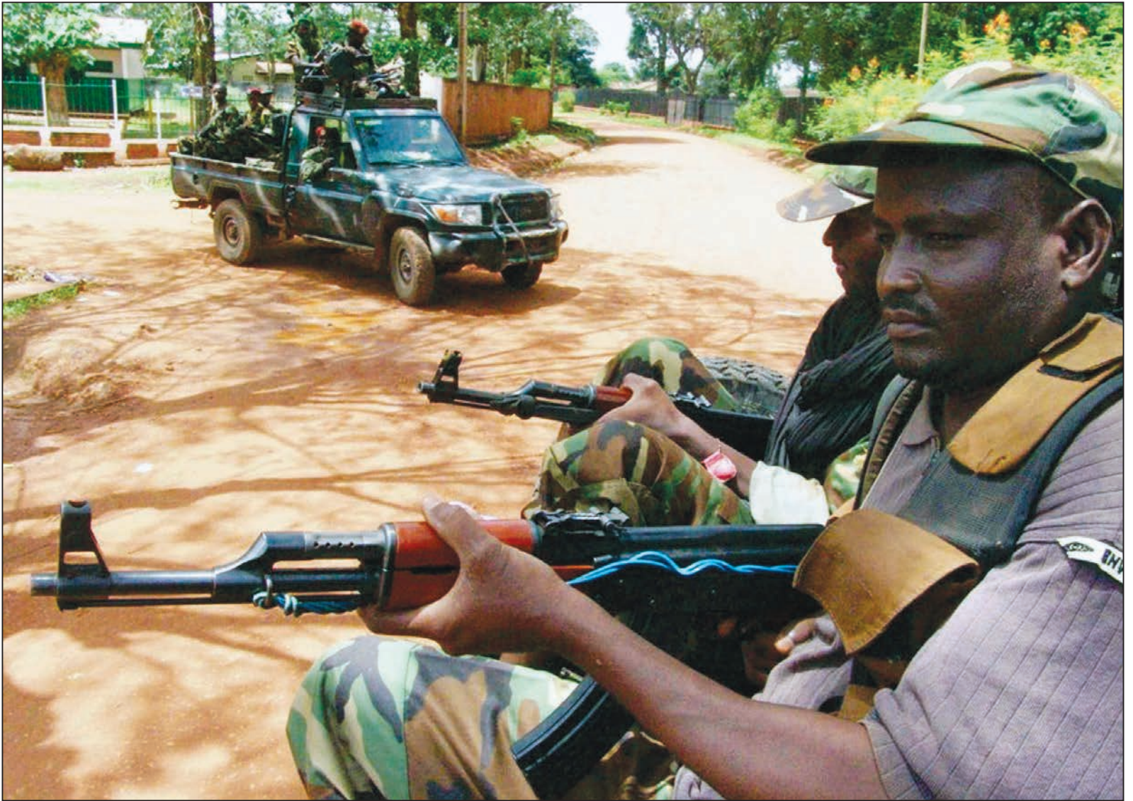
Armed rebel fighters calling themselves Seleka (“Alliance”) patrol the streets in pickup trucks to stop looting in Bangui, Central African Republic, on March 26. Church leaders in the Central African Republic appealed for international help in restoring order after a wave of attacks on Catholic clergy and churches.

of Arab-speaking Islamists, seized Bangui in late March, suspending the country’s government, parliament and constitution, after the latest agreement collapsed with Bozize, who fled to neighboring Cameroon.