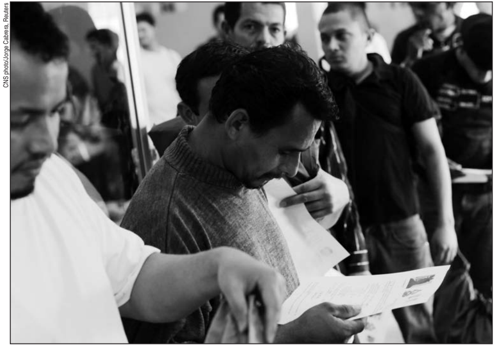
Deportees check immigration documents after they arrive in San Pedro Sula, Honduras, on an immigration flight from the United States in late March. As the U.S. Senate returns after break and tens of thousands plan a rally, Washington lawmakers focus on immigration reform.

“Some are trying to pit economic interests against families,” Trumka said, as if the value of admitting a worker’s brother, sister or child is less important