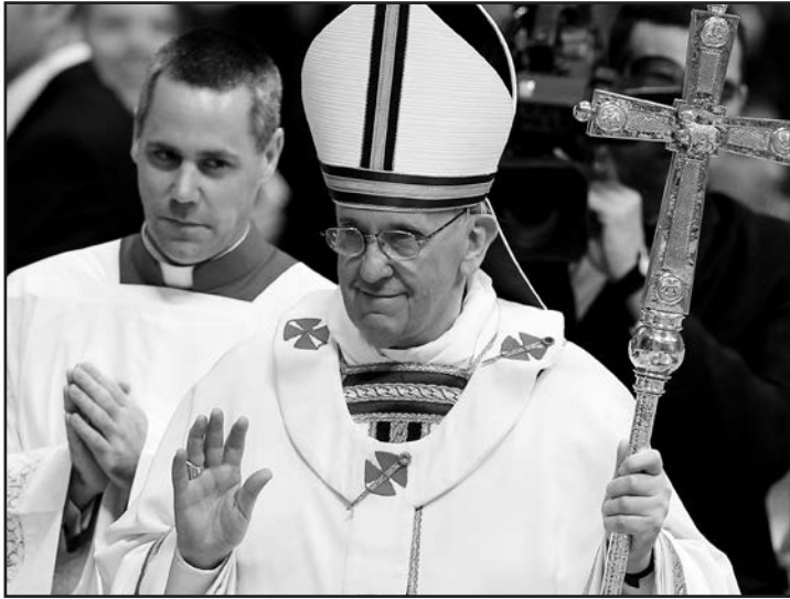
Pope Francis greets the faithful as he leaves after celebrating the Easter Vigil in St. Peter's Basilica at the Vatican on March 30.