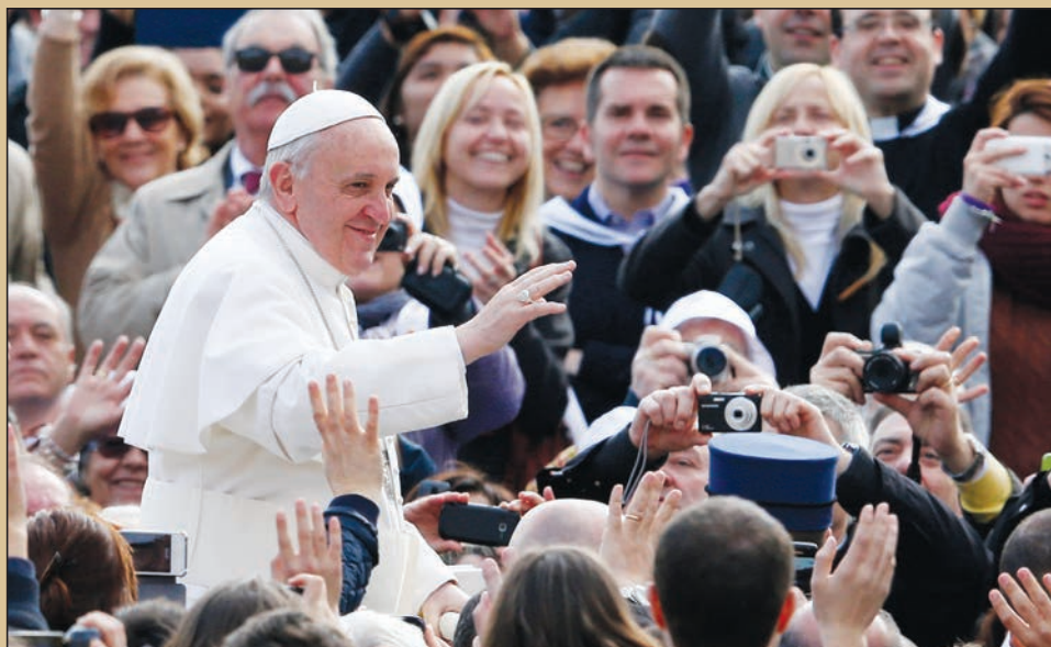
Pope Francis greets the crowd as he arrives to lead his general audience in St. Peter's Square at the Vatican on April 3.

In what has already become a common sight during his young papacy, a number of pilgrims, including a group of Jesuit deacons studying in Rome, broke Vatican protocol by embracing Pope Francis and kissing him on both cheeks. †